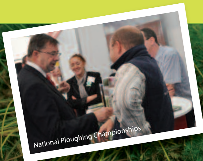
National Ploughing Championships

Highly Productive Master Educator's Meeting