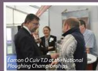
Eamon Ó Cuív T.D. at the National Ploughing Championships

Over the summer months Leave No Trace Ireland has taken part in a range of events to spread the message and to engage with outdoor enthusiasts all over Ireland.