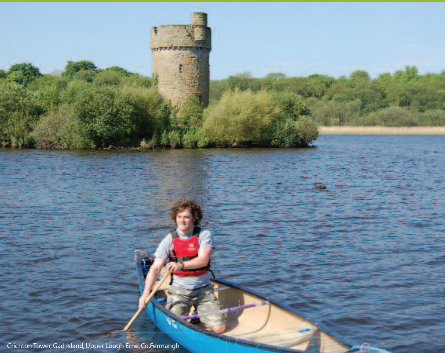
Crichton Tower, Gad Island, Upper Lough Erne, Co.Fermanagh