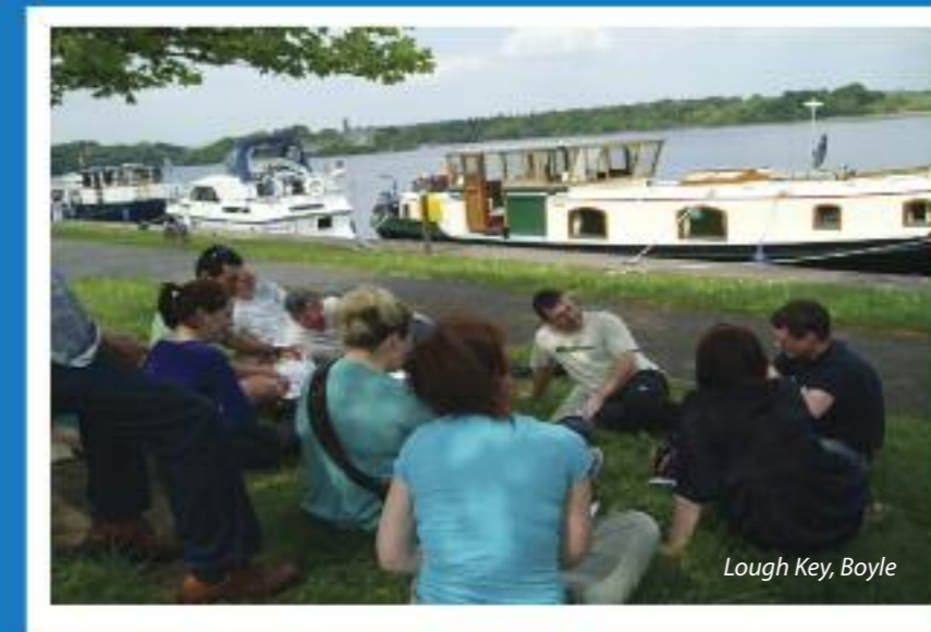
Lough Key, Boyle

Leave No Trace Ireland held a workshop on water as part of its network meeting, to offer people a chance to learn more about the Leave No Trace message and its application across a broad range of land and water-based recreation activities. The event which also incorporated its AGM took place on Saturday 22nd May 2010 at Lough Key Forest Park in Boyle, Co. Roscommon.