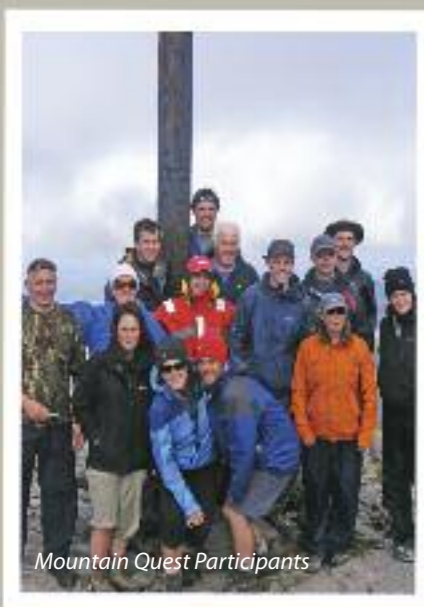
Mountain Quest Participants

Carrauntuathail in Kerry, all in aid of a fundraising challenge for the Irish Disabled Sailing Association.